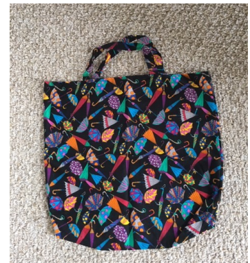
Food Bag for Age Well