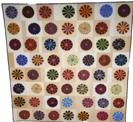
Wendy Thompson—Swaying Sunflowers