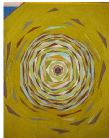
Impracticality by Angela Walters