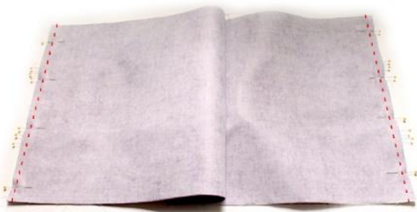
Step 4 & 5

The red dotted lines indicated the location of stitching in Step 5.