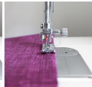
Needle far left