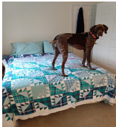
Ellie choosing where to take a bite