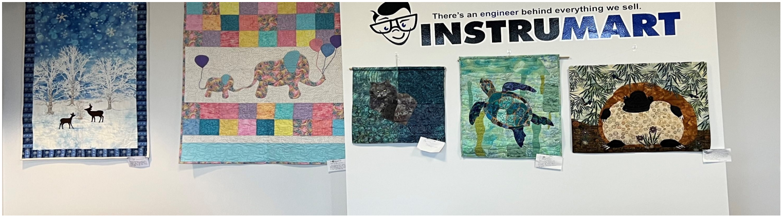
The Animal Challenge Quilts!