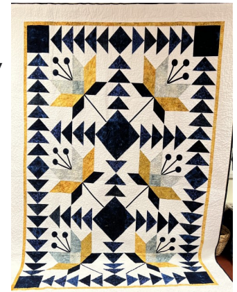
2024 raffle quilt Geese in the Lilies