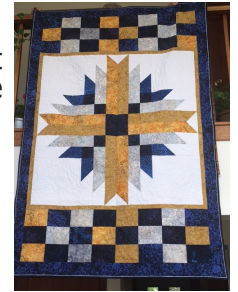
Member raffle prize