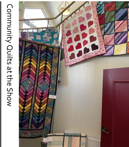
Community Quilts at the Show