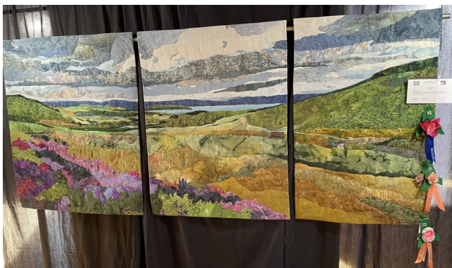
Viewer's choice 2024—Anne Standish