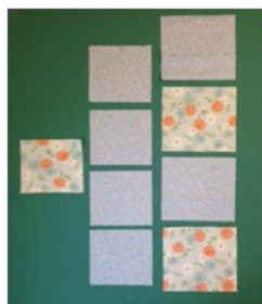
1. Your cut pieces

Note: Using 3 5/8" cuts down on some waste when cutting the half square triangle blocks.