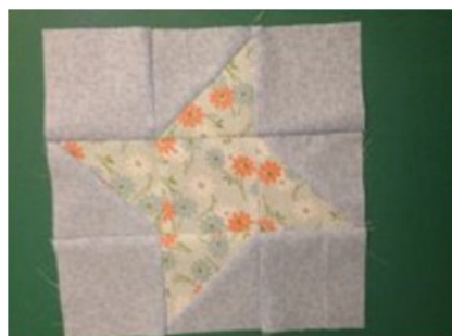
5. Sew together using precise or scant 1/4" seams so that seams nest. Press. Block should measure 8" square.