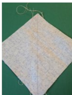
3. Cut on the diagonal line and press the seams to the darker fabric. Half square blocks should be trimmed to 3".