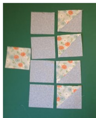
4. You should have the following blocks available for assembly. Line them up as follows