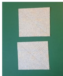
2. Draw a line diagonally from corner to corner on the wrong side of the lighter 2 5/8" squares. Sew 1/4" away from each side of the center line