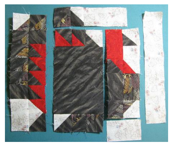
Final Block should measure 8 1/2" Unfinished Make one for each chance to win the entire batch. Have fun, good luck at the drawing.

For additional details on <sup>1</sup>/<sub>2</sub> square triangles and pressing instructions, see the Raffle Block section of the website