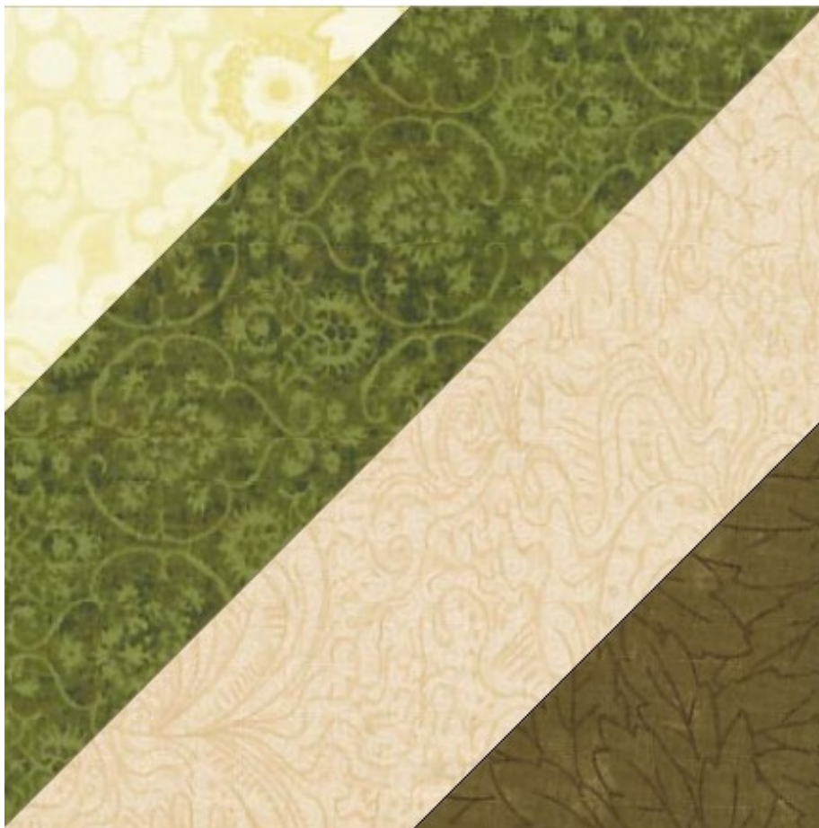
Reduced image of single November Raffle Block