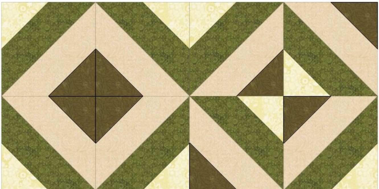
Quilt Image of 4 Raffle Blocks Assembled