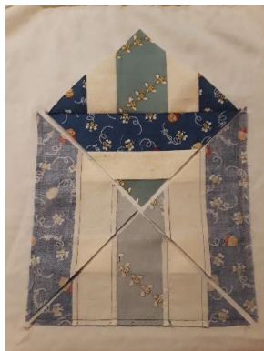
CUT & PRESS