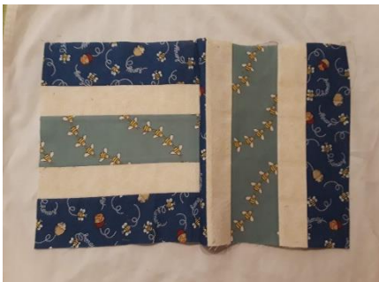
PLACE RIGHT SIDES TOGETHER