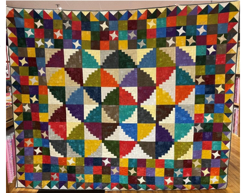
2022 Raffle Quilt "Wings of Joy"

Wings of Joy Quilt Show, April 22-24 2022 Contest Quilts, Vendors, Raffle Quilt winners!