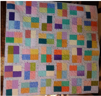
Camp Ta-Kum-Ta quilt by Teela

Be certain to visit the Community Quilts table at guild meetings. The themes this month are squares and plaids. We have a variety of woven plaid fabrics available on the freebie table. They are not only good for quilts but also placemats, napkins, mug rugs, etc. Sew around the perimeter to make a fast napkin. There will be a sample on the table.