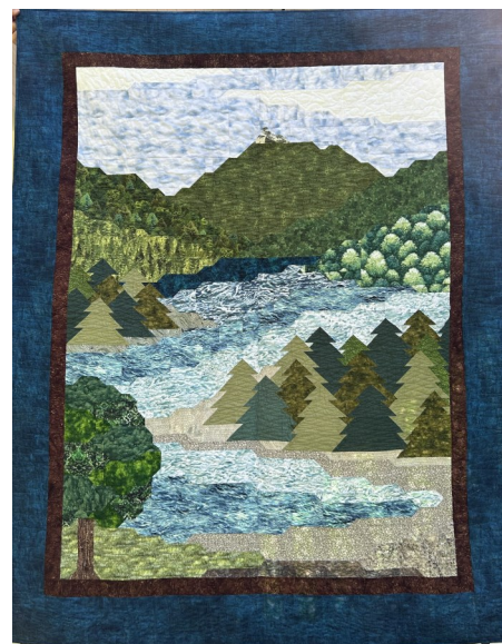
2025 Raffle Quilt