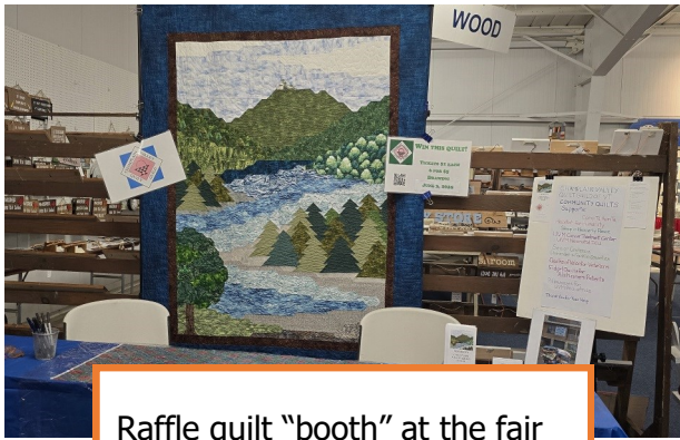
Raffle quilt "booth" at the fair