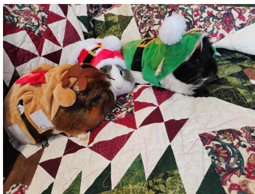
Santa pig, Elf pig, Reindeer pig