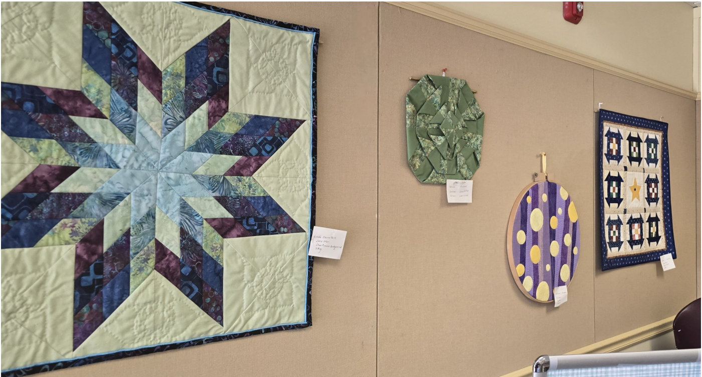
Challenge quilts at the Hinesburg Library (see page 2 for more)

Catherine Redford Zoom workshop on January 11 produced at least one finished project! Marti used some "orphan" blocks to practice the walking foot quilting and then finished into "mug rugs"