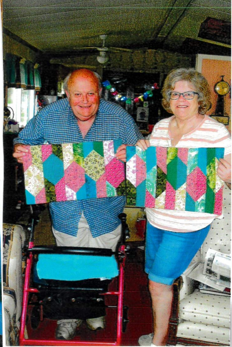
Made by CVQG members for Community Quilts